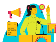
Public policy, public affairs, cultural and creative policy