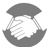
Collaborative partnership and co-production