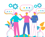
Human Resource and Volunteer Management