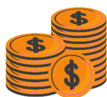
Financial management, income generation and enterprise