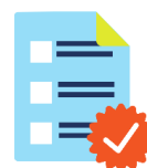
National and local government and statutory bodies