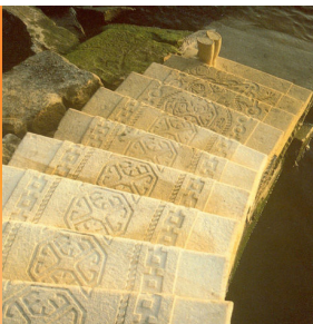
Stone Stair Carpet by Colin Wilbourn Photo: Colin Wilbourn