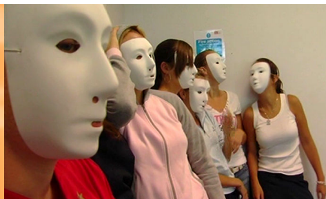
Still from the Documentary: Superkrush Productions

PIONEERING COLLABORATIVE PARTNERSHIPS THROUGH THE ARTS