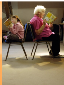
At the book launch.

PIONEERING COLLABORATIVE PARTNERSHIPS THROUGH THE ARTS